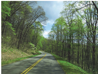
Blue Ridge Parkway

Finally, the city can draw inspiration from interesting precedents with respect to developing convivial and safe park lanes.