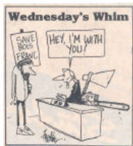
The Chronicle, October 18, 1989