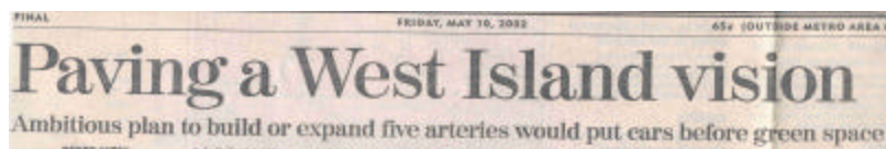
Montreal Gazette, May 10, 2002 12

In 1998, the MUC planned to lease the Manoir for up 30 years, for a Hotel/Restaurant project. Saraguay Citizens Group rallied 150 residents to the public hearing at the Manoir. The powers that be had forgotten the grit of Saraguay residents. They had set out only 40 chairs! The plan was soundly trounced. Then in 2001, the old City of Montreal planned to take over and develop the Manoir for multi-purpose use unrelated to the Nature-Park. The formation of the new city has halted this process for now. Saraguay Citizens Group presented a brief at the Montreal Summit, calling for this "forgotten nature-park" to be opened to the public and for park facilities be set up at the Manoir, before it falls prey to developers. Bois-de-Saraguay Nature-Park was acquired more than twenty years ago! There are no services to welcome the public; majestic riverfront sections of the park remain fenced off and inaccessible. Vandals have fired two heritage buildings on the abandoned site; one was then torn down by the MUC.