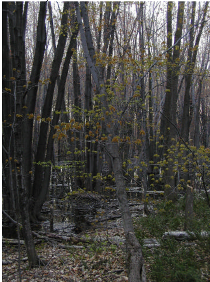
Bois de Liesse in the springtime 11