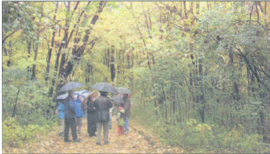
Members of the Tremblay administration tour the Bois Franc forest in last weekend's rain.

last portions of the New City's green heritage. Failure to provide the needed funds now will mean that these lands will be built over and our Island will soon become Asphaltville.