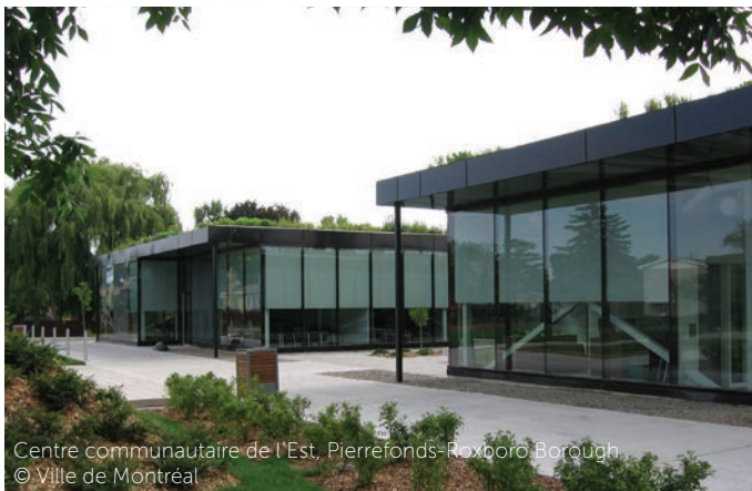
Centre communautaire de l'Est, Pierrefonds-Roxboro Borough

TCEP Investments (2013-2015) on municipal public facilities : $378 M