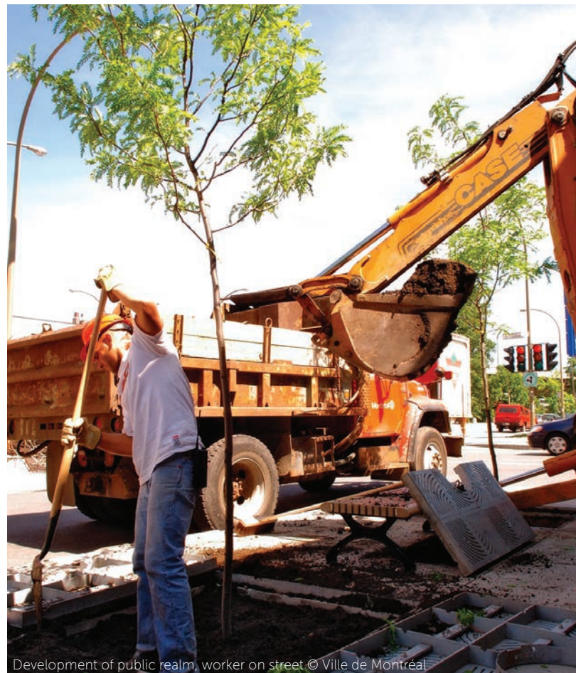
Development of public realm, worker on street