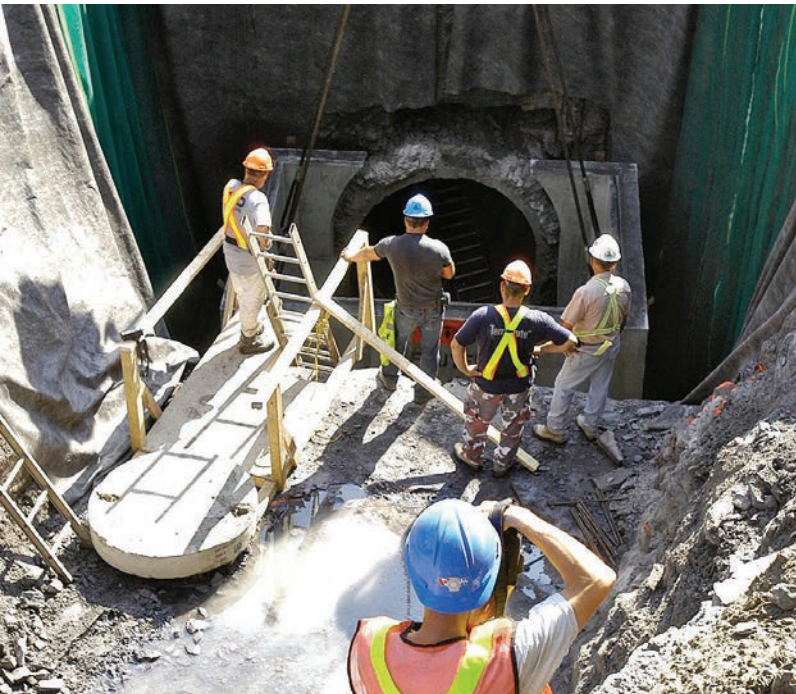
Water distribution work site