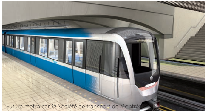
Future metro car

The Société de transport de Montréal (STM) wants to increase the number of trips made using public transit by 40% by 2020. However, the funds allocated are inadequate, both for maintaining current levels of operation and for improving services. Substantial financial support from higher levels of government is required, as well as new dedicated revenue sources. The City proposes to increase the gas tax and to index the tax on vehicle registration fees in the entire AMT territory. It is also calling for the establishment of a regional road tolls to fund road and public transport infrastructure.