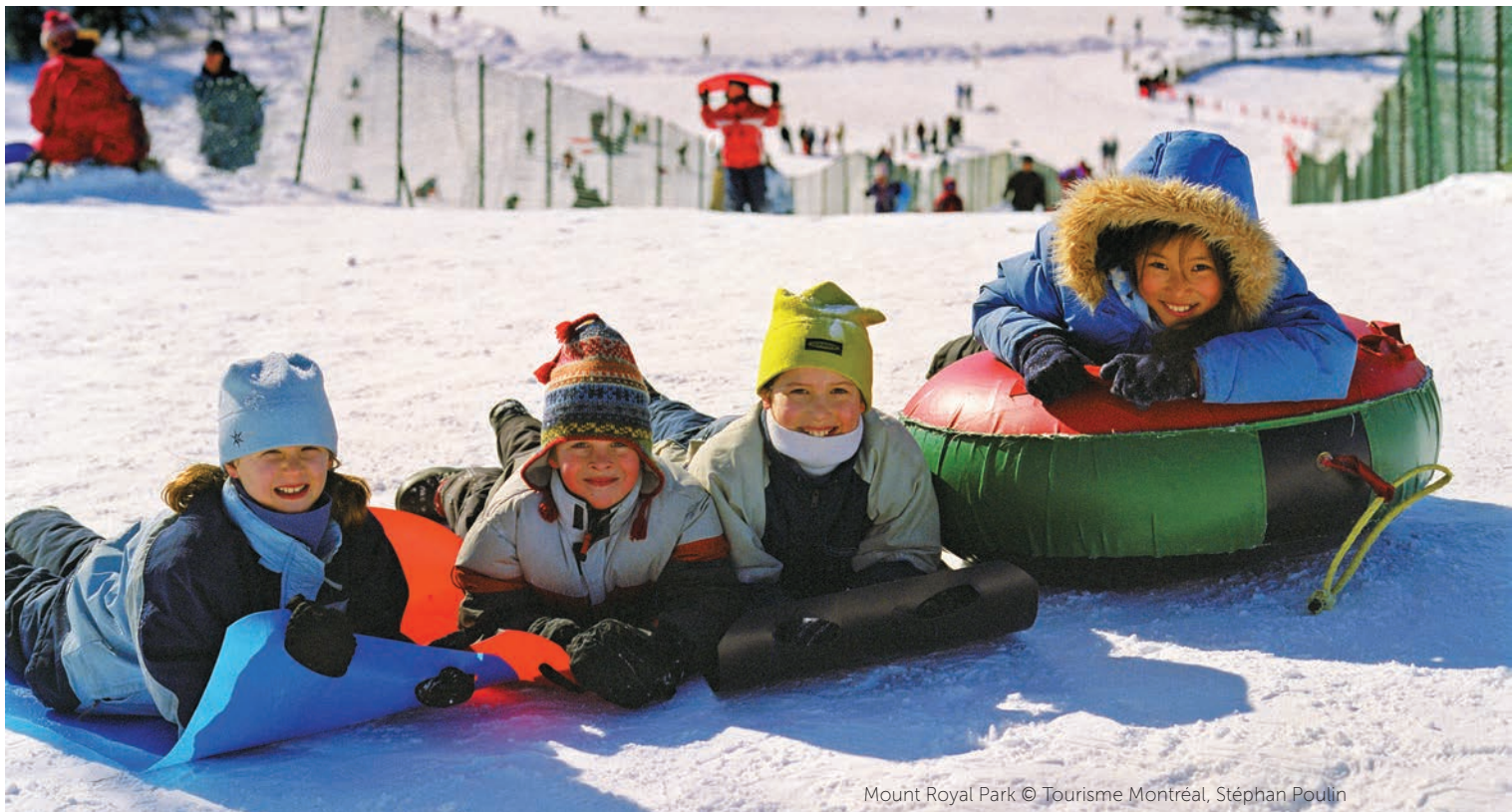
Mount Royal Park

By stimulating residential demand and supporting housing construction, Montréal will contribute to the consolidation of the central metropolitan area and maintain its demographic weight in the region. This will also be an opportunity to promote a variety of types of housing, including social and affordable housing and large homes for families.