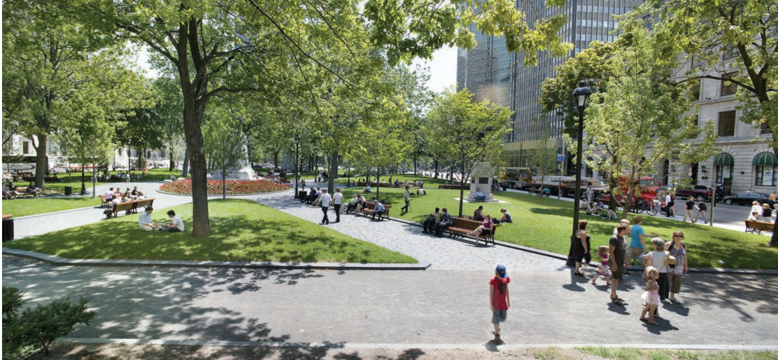
Square Dorchester, Ville-Marie Borough