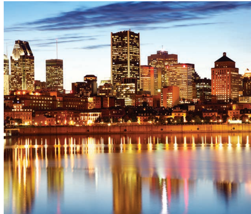
A view of Montréal from Jean Drapeau Park

Other aspects of the implementation of the Plan will call for the introduction of special tax incentives, such as support for the creation of affordable housing in the city, financing public transit or creating programs to revitalize underprivileged sectors.