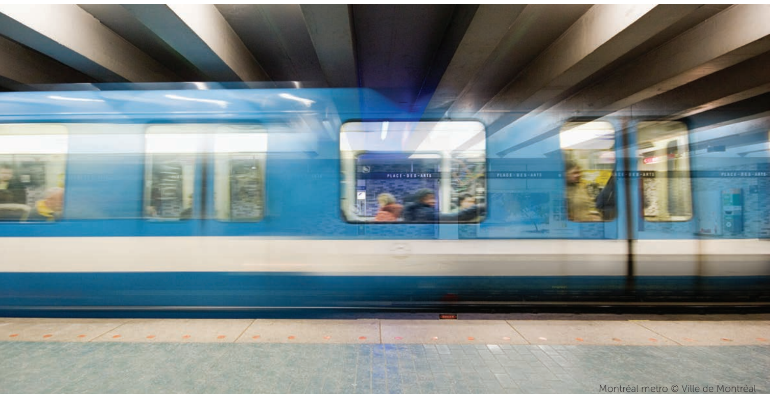
Montréal metro

Similarly, the city plans to strengthen Montréal's economic role as a shipping hub, by encouraging freight transportation logistics, near the airport and the port, and relying on rail and highway infrastructures.