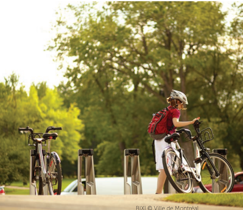
BIXI © Ville de Montréal