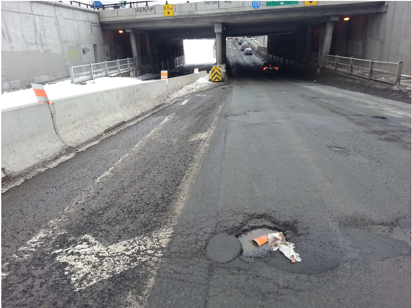
Illustration 1: Girouard tunnel facing south