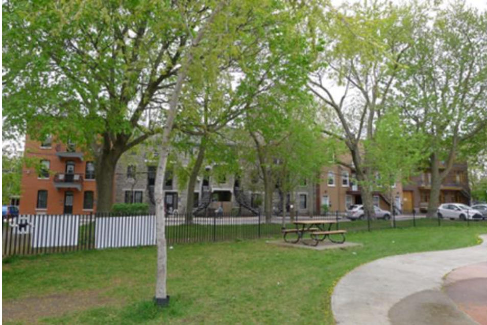
Figure 6: Plant life in the area

The Sud-Ouest borough would like to carry out an exemplary development geared to an ecological transition that is in keeping with Montréal’s environmental goals (Sustainable Montréal, Climate Plan, Canopy Action Plan, etc.).