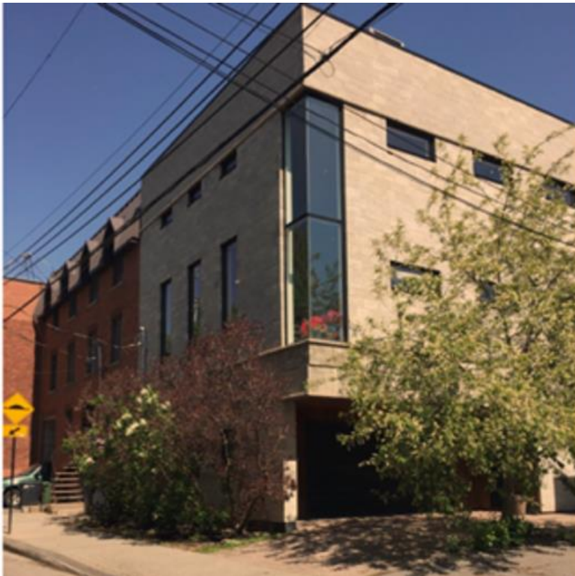
Figure 3: Examples of existing buildings

Moreover, it is important to note that the properties are private and that residential developments will be subject to the By-law for a mixed metropolis.